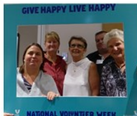
Friday Kiosk Team