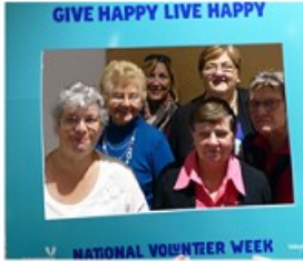
Tuesday Kiosk Team