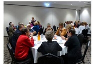
Volunteers enjoying NVV Celebrations