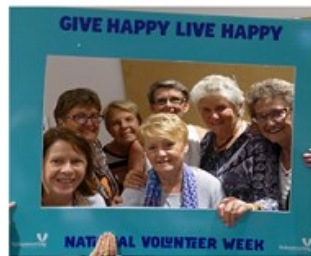
Monday Kiosk Team